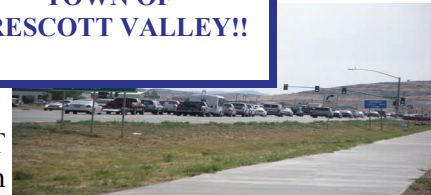
Prescott Valley Central Core Multi-Use Path

Round 15 Year application cycle began April 2007, and are due to CYMPO no later than August 8, 2007 with final submissions to ADOT by August 31, 2007. Additional information on the Transportation Enhancement program is available at http://www.dot.state.az.us/highways/SWProjMgmt/enhancement/index.asp .